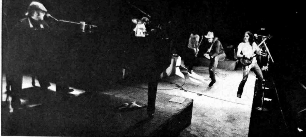
ELTON JOHN joined the Eagles for an encore at Wembley on their Thursday night appearance in last week's string of concerts there. Elton, pictured left in his cap, joined them for a rocking version of 'Oh Carol'.