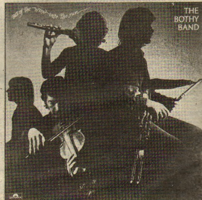
ALBUM 2383 456 · CASSETTE 3170 456

HAVE A NEW ALBUM OUT OF THE WIND INTO THE SUN