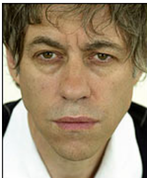
Bob Geldof: Strummer's legacy was "imperishable"

Left-wing singer Billy Bragg told BBC News 24 the band made him aware of politics after he