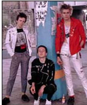
Strummer, centre: Walking it like he talked it

The first wave of punk bands had a rather ambivalent attitude to the politics of late 70s Britain. The Sex Pistols, The Damned, the Stranglers, none of them, not even the Jam, came close to the radicalism that informed everything the Clash did and said.