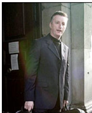
Billy Bragg: Politically inspired singer-songwriter

While Paul Simonon flashed his glorious cheekbones and Mick Jones threw guitar hero shapes, no-one struggled more manfully with the gap between the myth and the reality of being a spokesman for your generation than Joe Strummer.