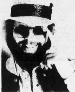
Hank Williams Jr.

T.G. Sheppard has been doing his share of benefits, too. He headlined one recently for the National Kidney Foun-