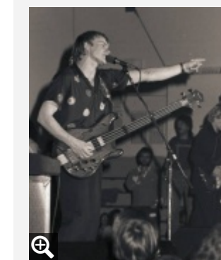
The Police performed at Clark Hall on UB's South Campus in 1980. Pictured above is Sting.