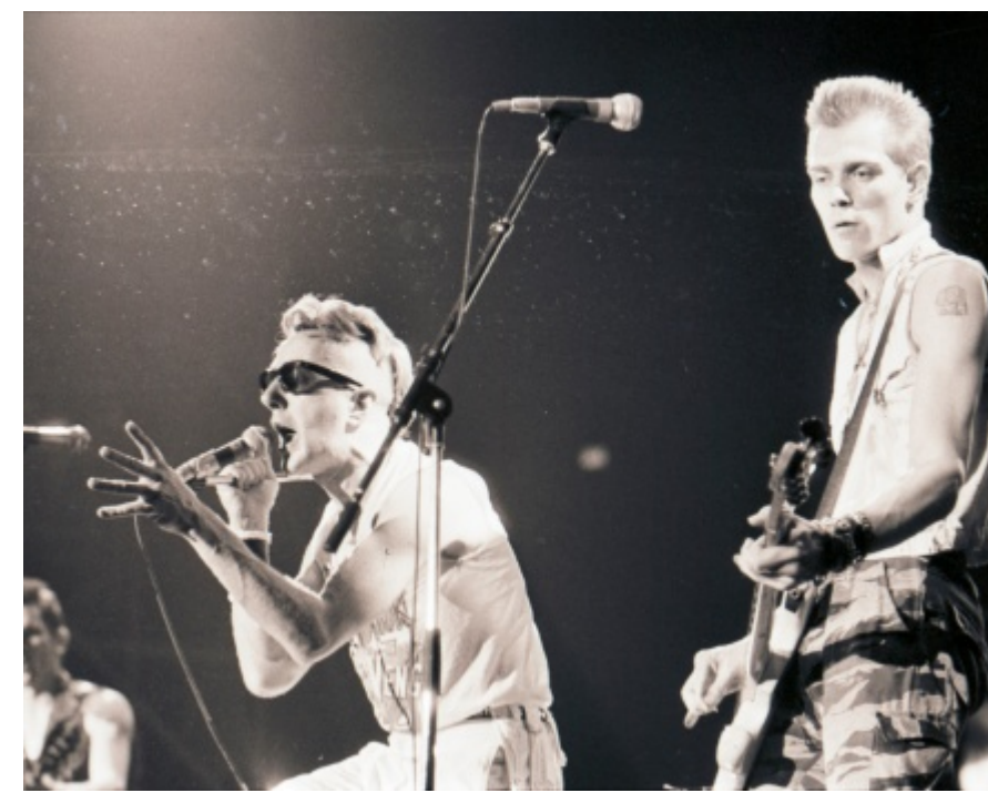
University archivists found the photos while working on 'Prominent Visitors,' University Libraries' latest exhibit.

Also found were photos of The Police's 1980 tour with XTC, and shots of the Talking Heads, Peter Gabriel, the B-52s and other acts