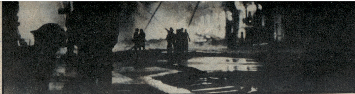
Death, doom and destruction in The World At War (C4, Sunday)