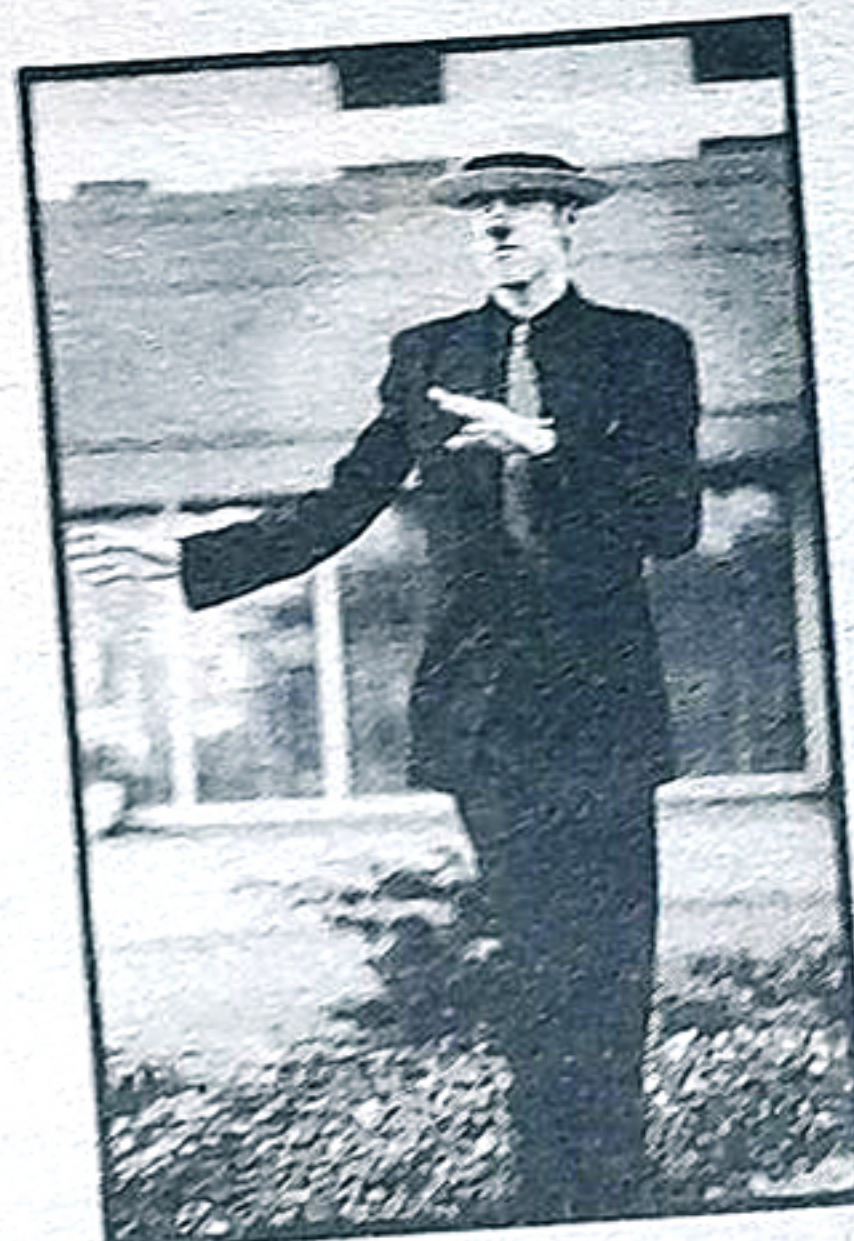
"What me worry?"

"I would like to state that the official press statement is untrue," Jones later stated. "I would like to make it clear that there was no discussion with Strummer and Simonon prior to being sacked. I certainly do not feel that I have drifted apart from the original idea of The Clash and in future, I'll be carrying on in the same direction as in the beginning." Meanwhile The Clash office continues to ward off all further queries with a series of "No comments".