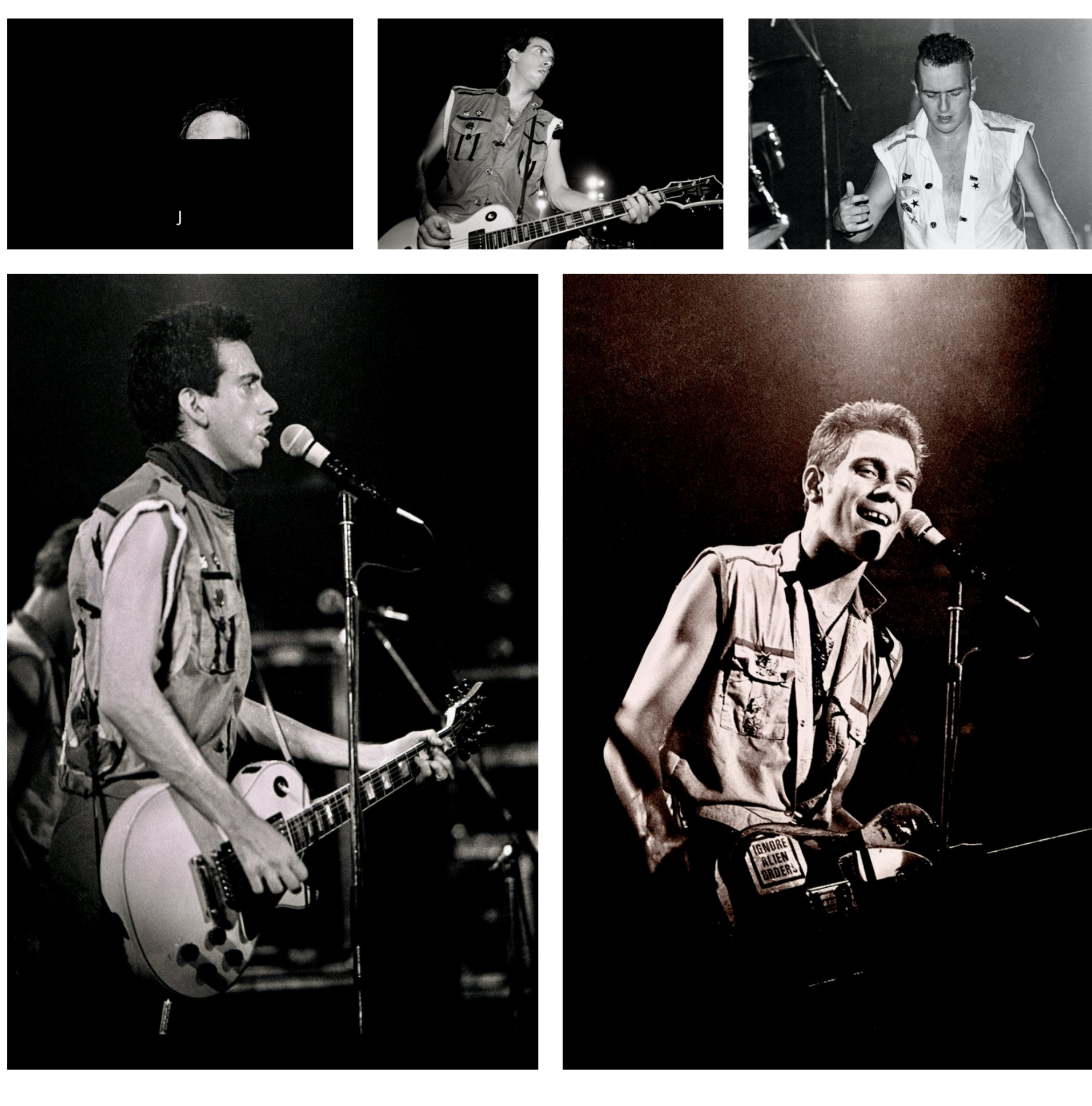
Click photo for larger image

This show eventually turned out to be the very last Clash gig in London with Mick Jones in the band. Things had begun to disintegrate right before the release of 'Combat Rock' when drummer Topper Headon was fired because of his heroin addiction. Strummer, Jones and Simonon soldiered on with Terry Chimes reclaiming the drum stool. However, the friction within the band was beginning to boil over around the time of this Brixton gig.