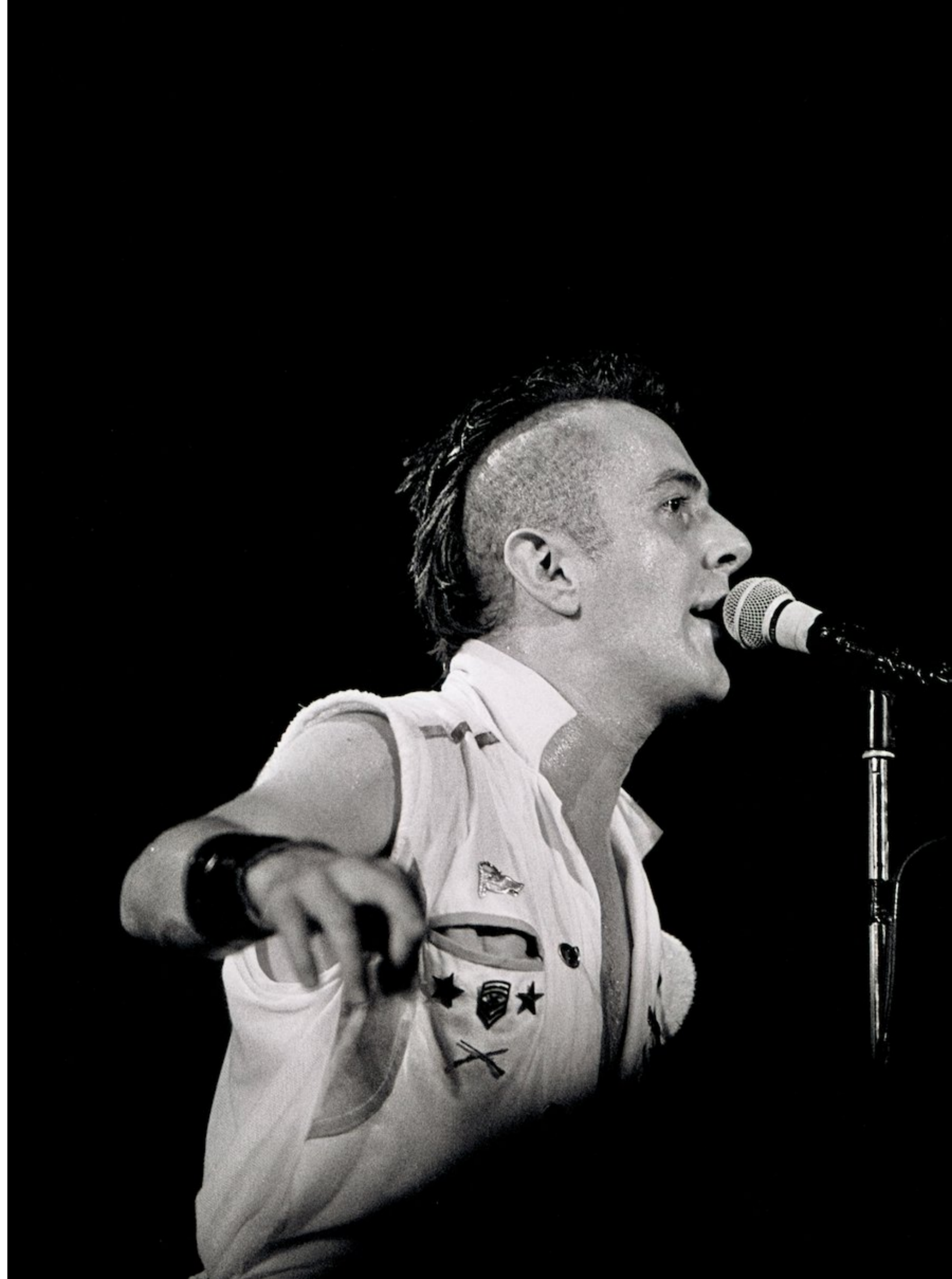
Joe Strummer