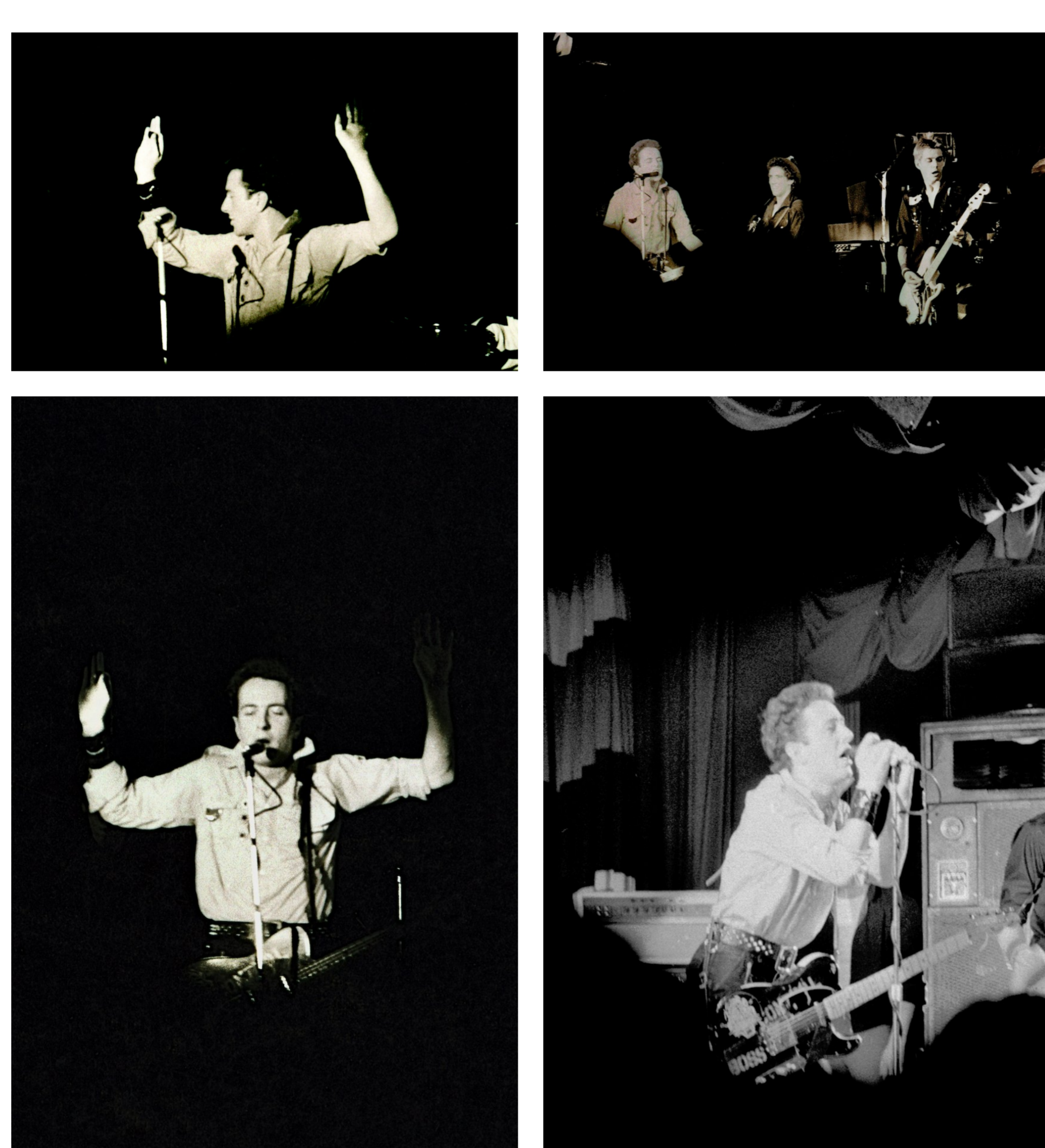
Click photo for larger image