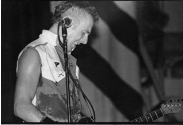
Rock the Coliseum: Strummer

Combining the ferocious combustion of drummer Nicky "Topper" Headon -- the secret hero of the band -- and bassist Paul Simonon with the fervent antics of singers Joe Strummer and Mick Jones, the Clash was the most exciting group in the world at that moment. Songs like "White Riot" and "I'm So Bored With the U.S.A." came across as religious screeds, turning the band's concerts into holy rock & roller tent revival gatherings.