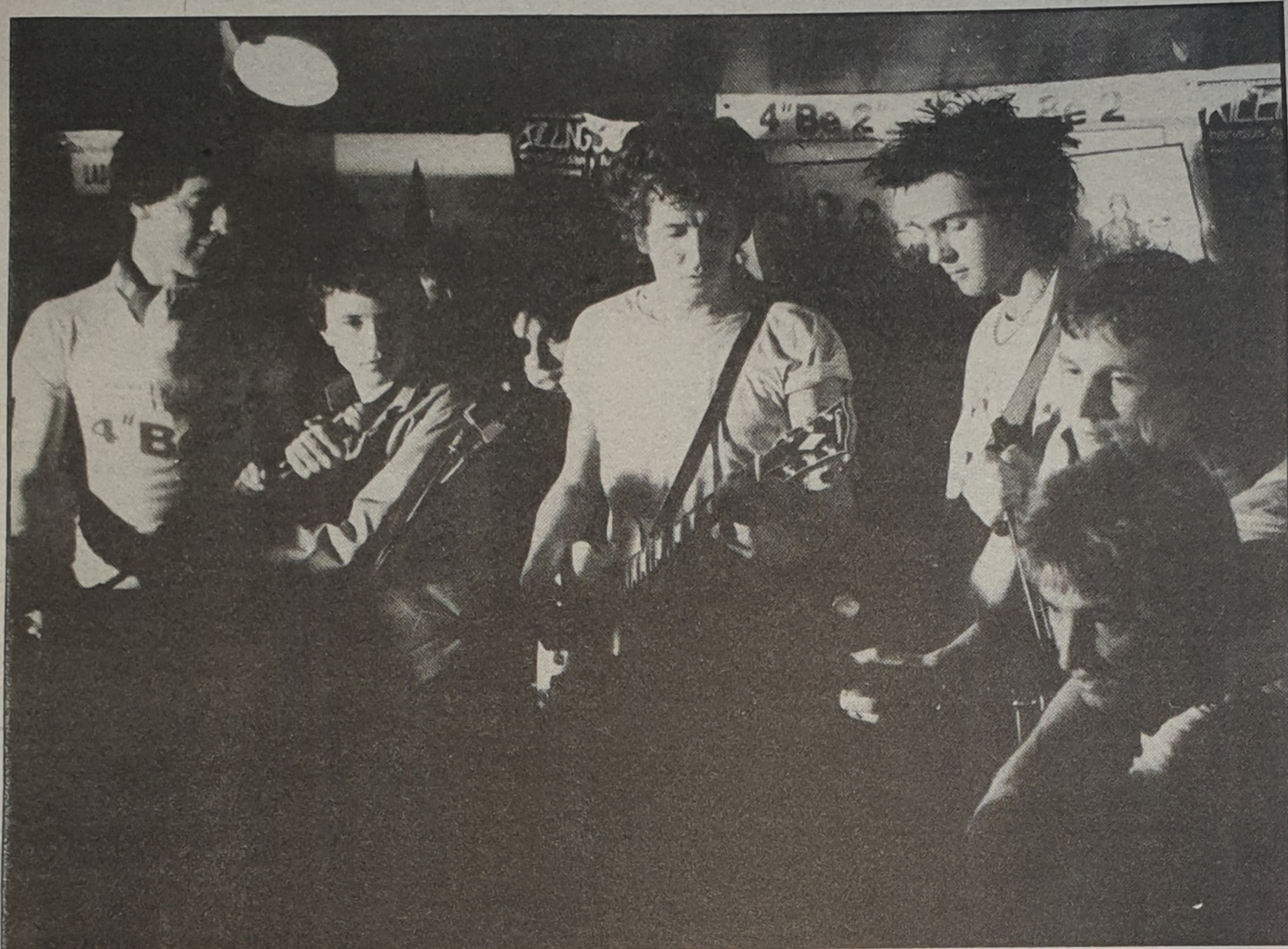
Pic by Gervaise Soeurouge