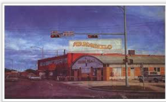
Armadillo World Headquarters 1979 - Austin,