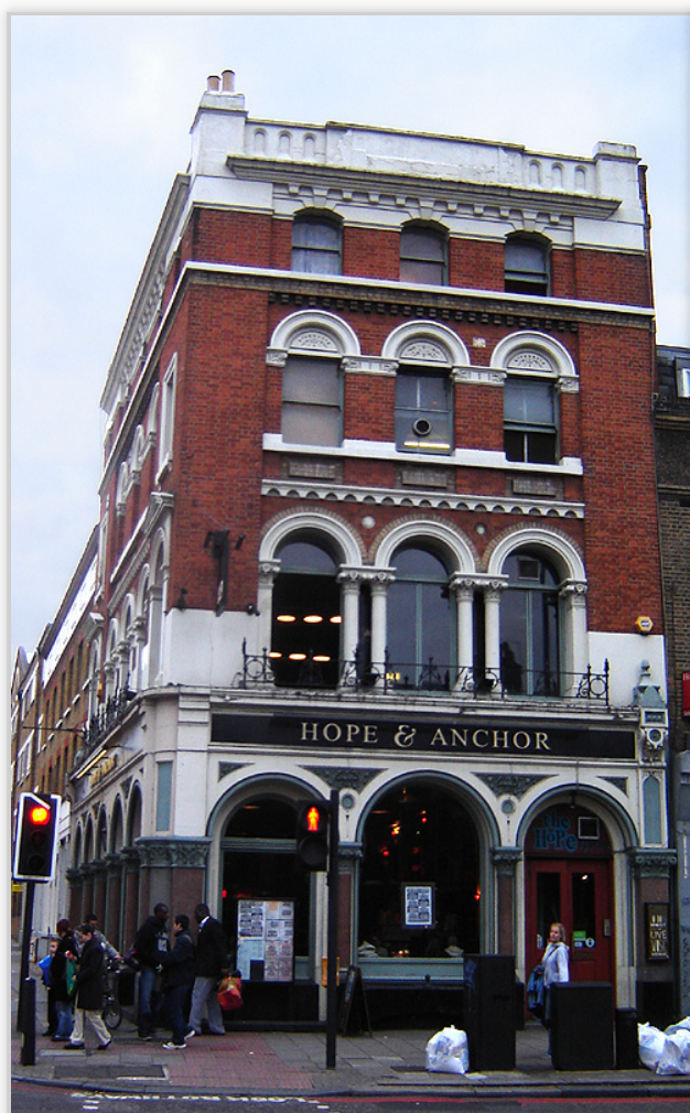
The Hope & Anchor Pub in Hackney