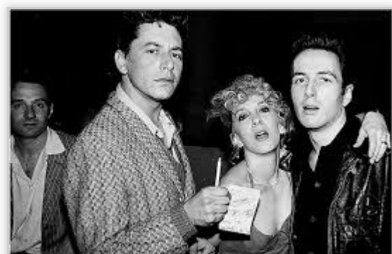
The Two Joe's Celebrate