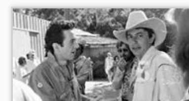
The Clash and Joe Ely Band