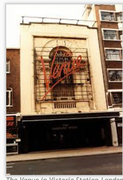
The Venue in Victoria Station-London