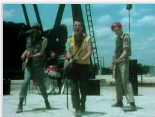
The Clash and Joe Ely Band