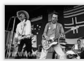
Joe Ely Band and The Clash Onstage