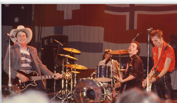
Joe Ely Band and The Clash