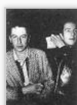
Joe Ely and Jow Strummer