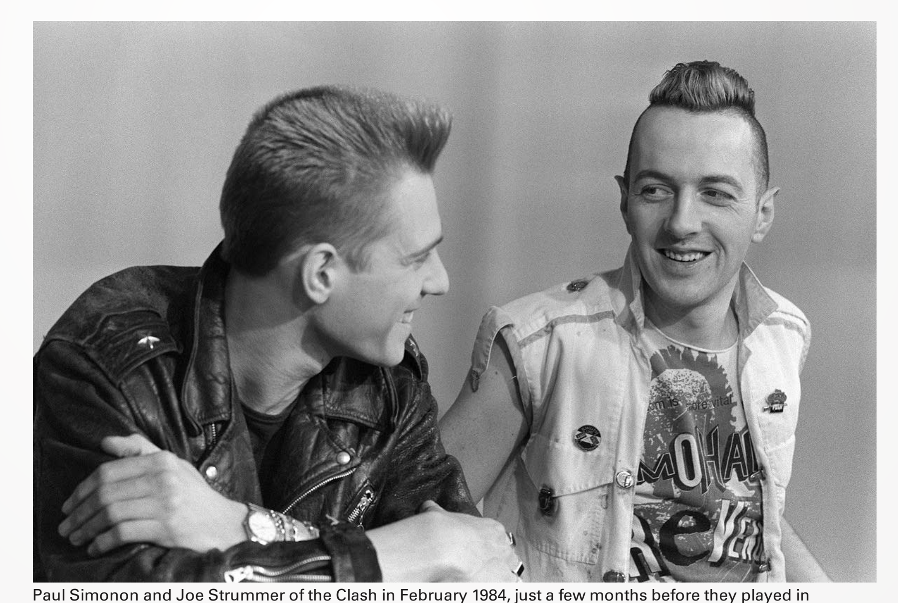
Minnesota for the last time.

installment in KEXP's annual celebration of "the only band that matters." 2019 is the 40th