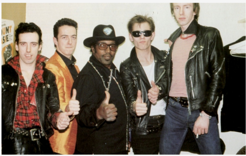
Clash fans often wanted Bo Diddley to go rather than stay while the opening act of the band's first North American tour

Victoria's all-female band The Dishrags opened to a good reception from the crowd but the second opening act, blues legend Bo Diddley, less so. The story goes that when 51-year-old Diddley rhetorically asked the crowd who they loved in his 1956 hit song " Who Do You Love? " — they loudly answered with "The Clash!" He was eventually pelted with debris and booed offstage.