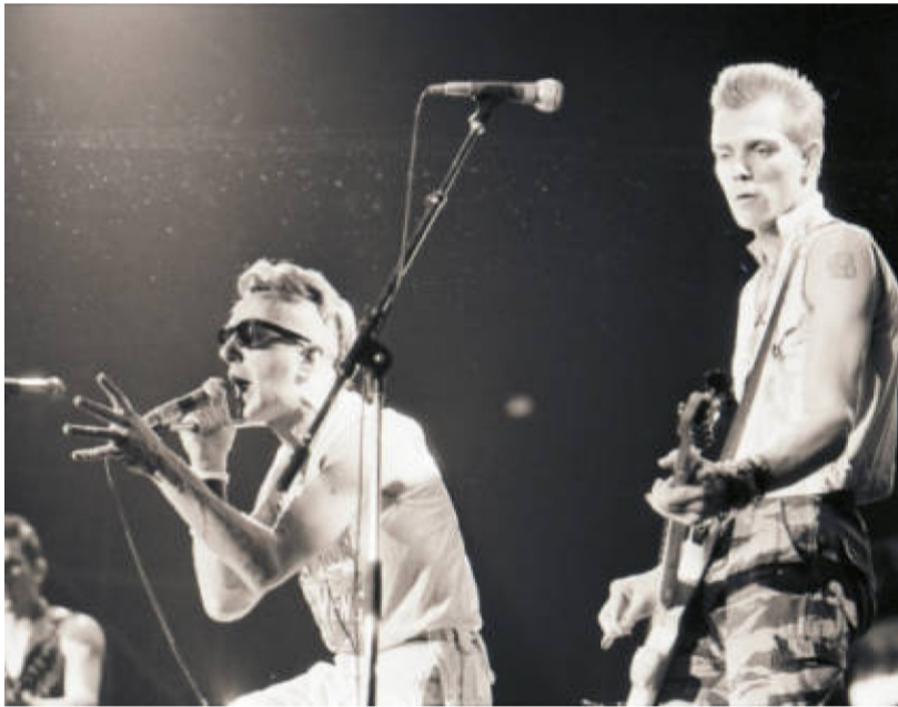
The Clash circa 1979.

British punk rock band The Clash launch a tour of North America with a gig at the Commodore Ballroom. Originally dubbed the Pearl Harbor tour, it was retitled the Give 'Em Enough Rope tour after their newly released sophomore album because their label, Epic Records, were worried American audiences might think the joke "too soon."