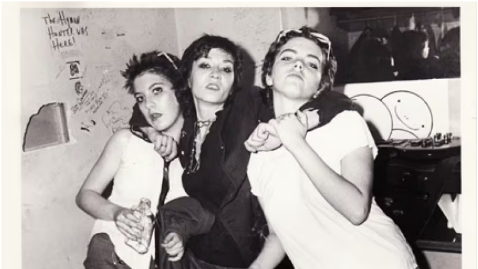
The Dishrags opened for The Clash three times, as well as for The Ramones.