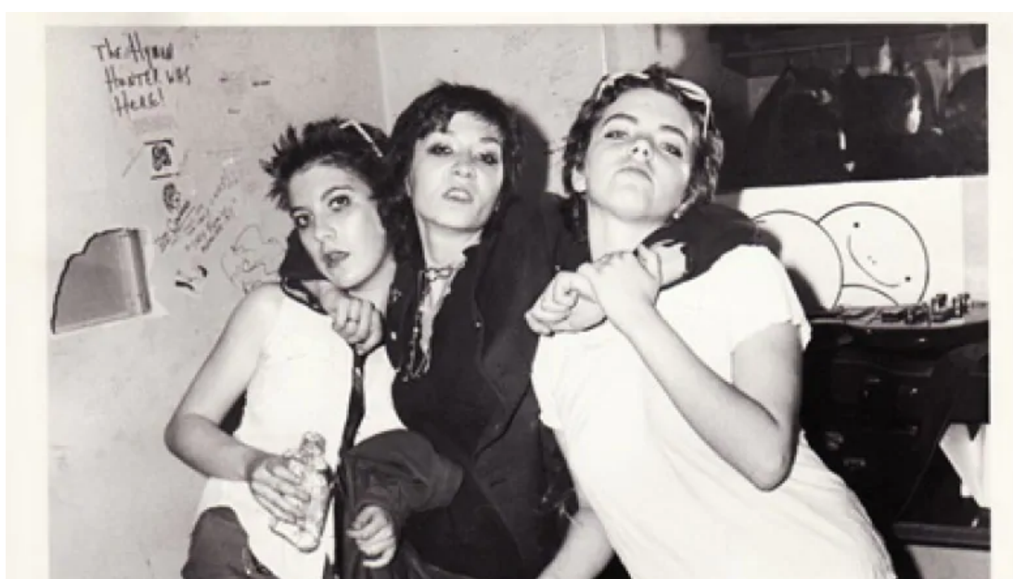
The Dishrags opened for The Clash three times, as well as for The Ramones.