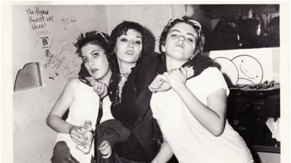
The Dishrags opened for The Clash three times, as well as for The Ramones.