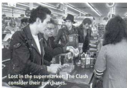
Lost in the supermarket: The Clash consider their purchases.