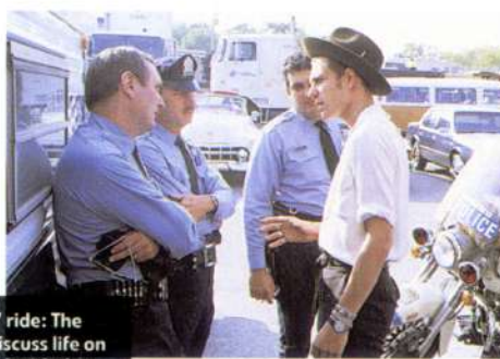
Park 'n' ride: The Clash discuss life on the road with the cops (above) and (below) Bo Diddley.

Joe Strummer: We decided to abandon the bus and catch a plane in Oklahoma City to get us to Cleveland. There was plenty of snow, fog and ice at the airport, but no planes. The bus had gone, so all we could do was sit and wait.