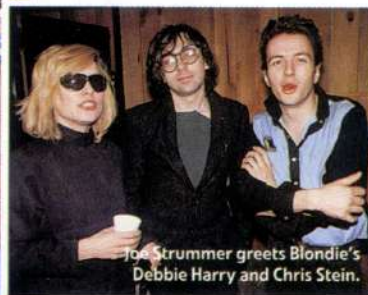
Joe Strummer greets Blondie's Debbie Harry and Chris Stein.