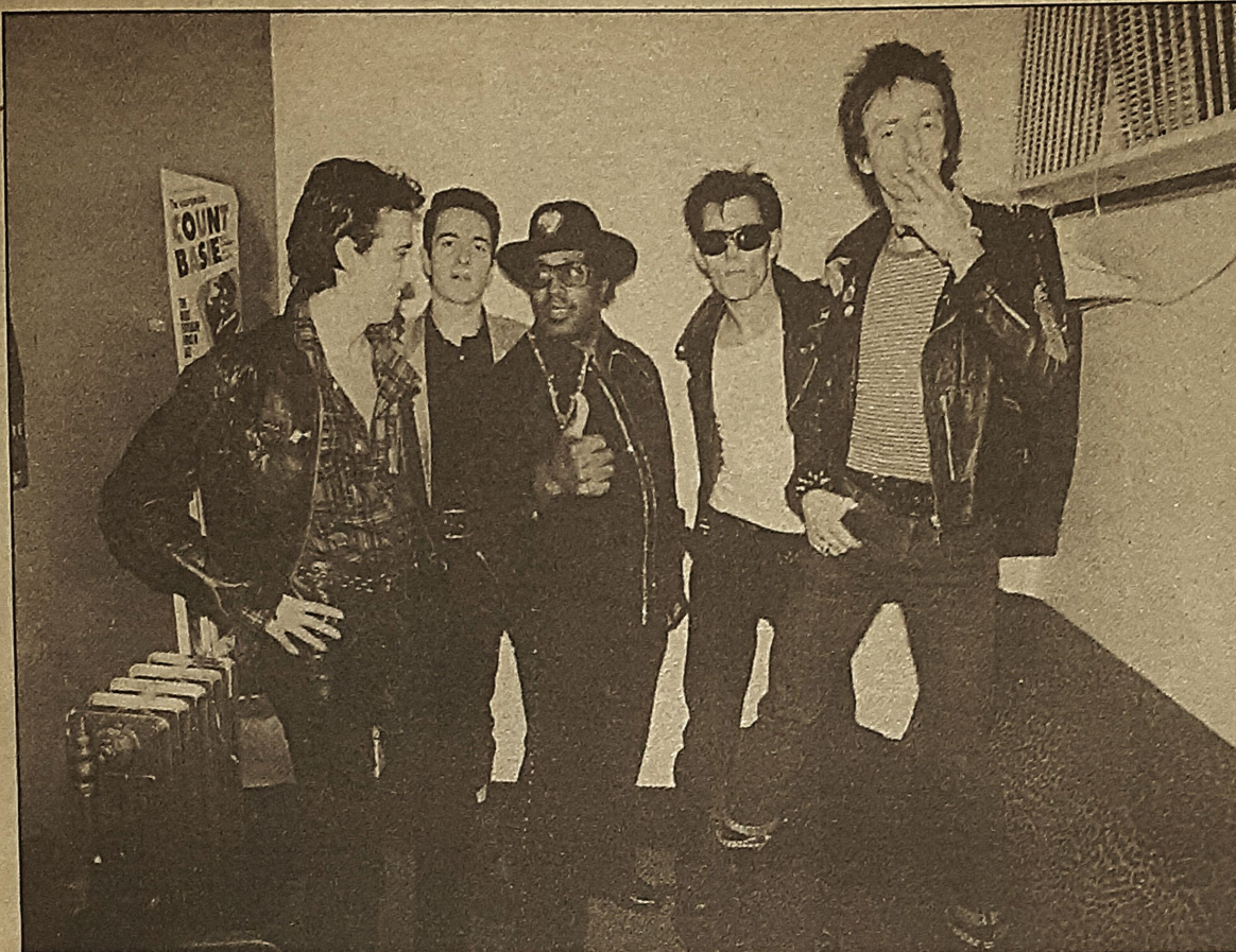
ONE OF these men is Bo Diddley

the driver tells him it's a rock band that's playing the Civic tonight. Underdressed the 70-year-old announces that he and his wife go disco dancing every fourth night. The bus breaks out in smiles. "All you've got to do is get in there and do your own thing, feel the beat," he tells us knackered looking bunch of youngsters. No-one offers him tickets for tonight's gig.