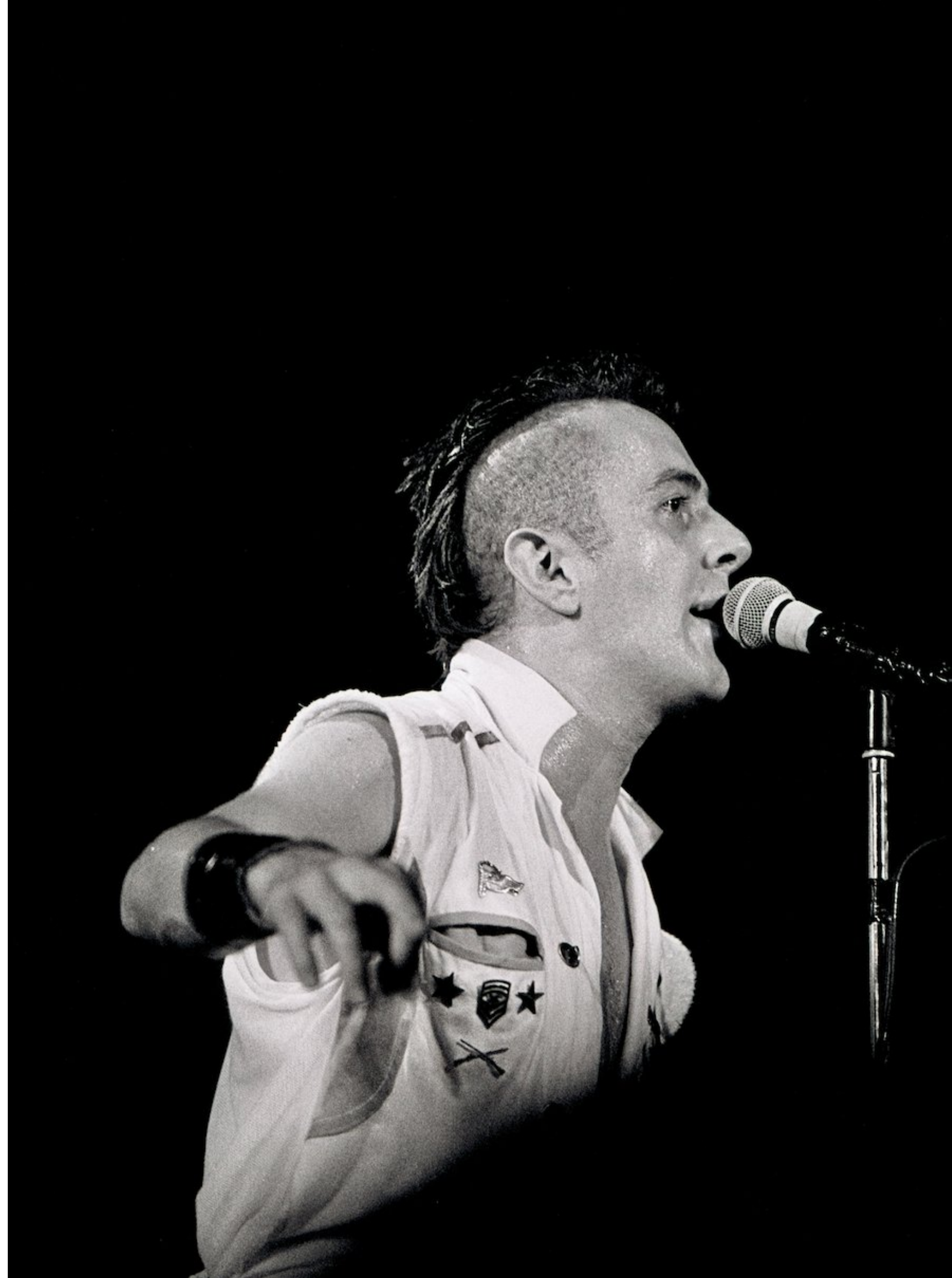
Joe Strummer