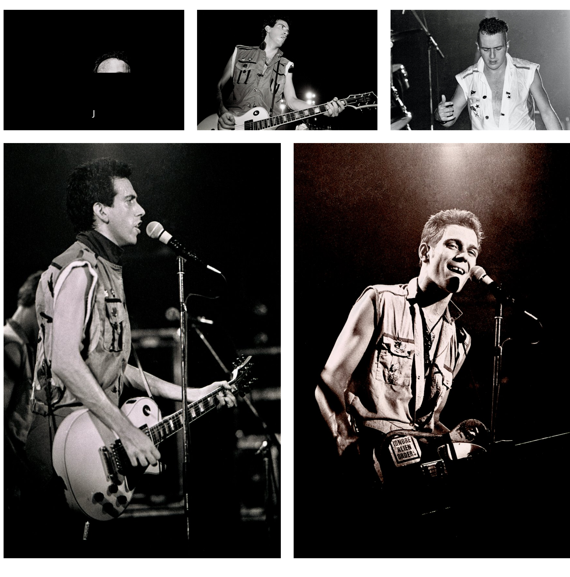
Click photo for larger image

This show eventually turned out to be the very last Clash gig in London with Mick Jones in the band. Things had begun to disintegrate right before the release of 'Combat Rock' when drummer Topper Headon was fired because of his heroin addiction. Strummer, Jones and Simonon soldiered on with Terry Chimes reclaiming the drum stool. However, the friction within the band was beginning to boil over around the time of this Brixton gig.