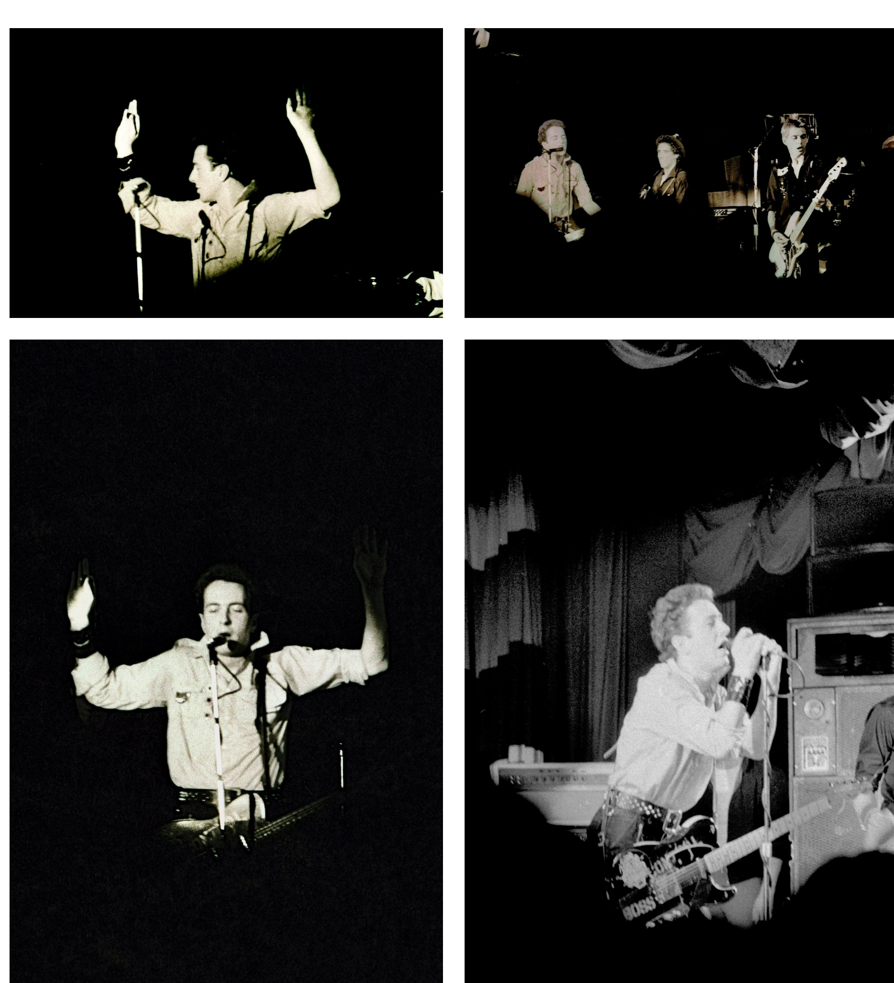
Click photo for larger image