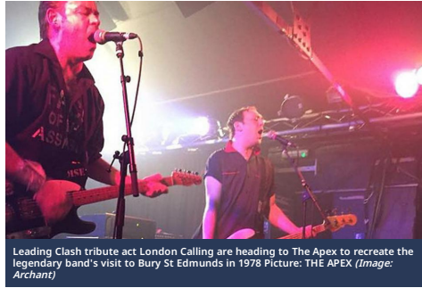
Leading Clash tribute act London Calling are heading to The Apex to recreate the legendary band's visit to Bury St Edmunds in 1978