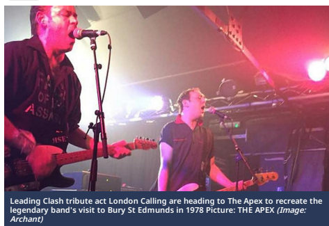
Leading Clash tribute act London Calling are heading to The Apex to recreate the legendary band's visit to Bury St Edmunds in 1978