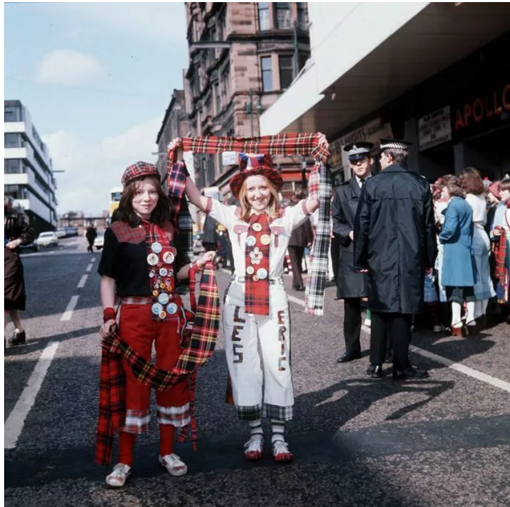
Bay City Rollers fans outside Apollo theatre Glasgow April 1975

We've had a look through the gig archives to bring you a selection of the most legendary shows the Apollo ever hosted. Let us know in the comments if there are any you think we've missed and should have included.