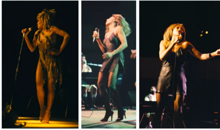
Tina Turner rocked Glasgow's legendary Apollo in 1984.

There were gigs every week at the Apollo, the biggest venue in Scotland at the time – and it was always well over its 4,500 capacity.