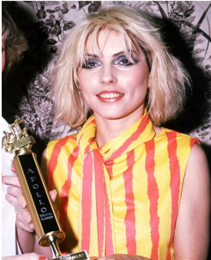
Deborah Harry of the pop group Blondie holding the famous Apollo Theatre Glasgow trophy in 1979.

Blondie were the band of the moment back in '79, and Glasgow got to bring in not just a new year - but a new decade - with Debbie Harry and co. Highlights of the Hogmanay 1979 show, which was televised live at the time, included a bagpipe rendition of the band's hit Sunday Girl, which sent the crowd bonkers.