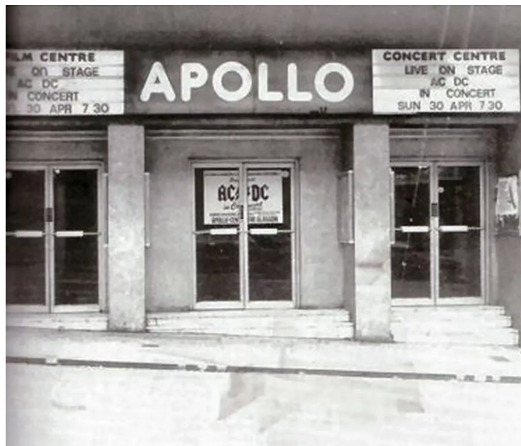
The entrance to the Apollo Theatre

David Beckham checking chicken coop for eggs