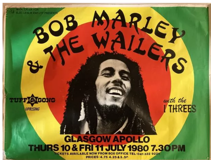
Promotional poster for Bob Marley & The Wailers at the Glasgow Apollo in 1980.