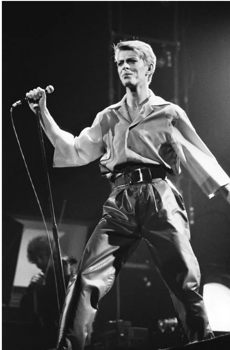
British pop singer David Bowie performing on stage during his concert at Earls Court, London on his Isolar II -1978 World Tour. 29th June 1978.

Between June 19-22, 1978, the absolute legend that is David Bowie played four consecutive nights at the Apollo, which proved to be a record for any single artist at the venue. This was Bowie's so-called 'Berlin era', with compositions such as Warszawa and Speed of Life contrasting splendidly with his earlier Spiders from Mars material.