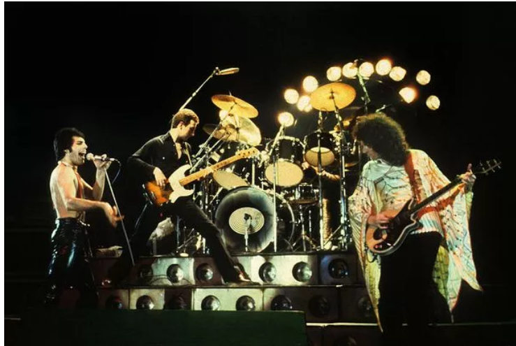
Queen perform on stage in 1979.

Queen headlined the Apollo half a dozen times, and while everyone will have their favourite, their setlist for the November 30 and December 1, 1979 concerts takes some beating. How the Apollo's decrepit upper circle dealt with the incessant foot stomping during We Will Rock You is anyone's guess.