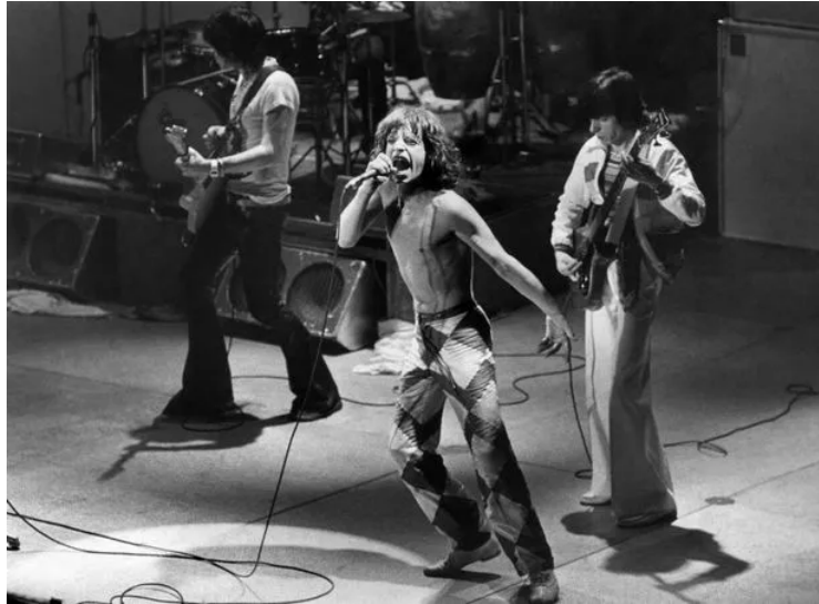
The Rolling Stones playing the Apollo in May 1976.