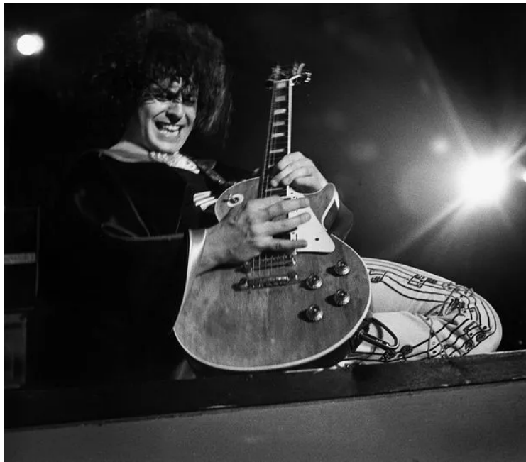
Marc Bolan pop singer on stage at Glasgow Apollo 1974 UNSEEN SCOTLAND PART 1 CELEBRITIES CODE USA025

Its notoriously 'bouncy' upper balcony and 16ft-high stage made it a unique place to see your favourite band - despite the fact, by most accounts, its interior was falling to bits.