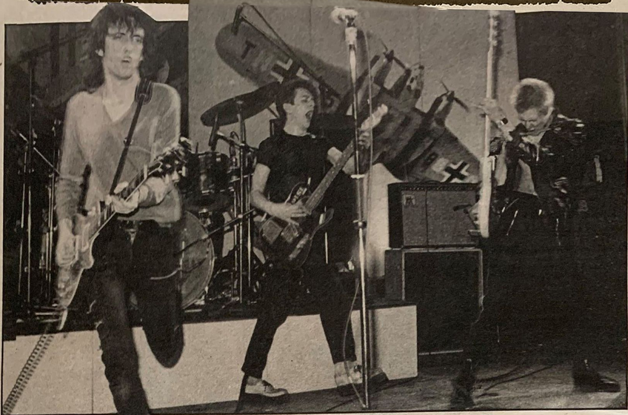
THE CLASH: heavy, heavy stuff