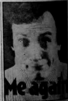
"Shep the dog got wildly excited when I performed and jumped up all over me," continues Vivian. "I wouldn't mind doing a whole album of voice music. There are some really stirring tunes, and I get the blood boiling. Actually I can play drums on cornet but I think this is more. It gives you a real sense of achievement." ROBIN SMITH