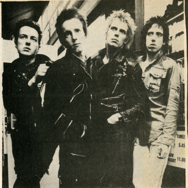
THE CLASH (l-r): JOE STRUMMER, NICKY HEADON, PAUL SIMONON, MICK JONES.

Belle Vue in Manchester was the venue, and the fanatical Mancunian fans ensured that it was a night to remember. Before The Clash had even finished their sound check the impatient throng outside had smashed its way through the plate glass doors and surged like a tidal wave into the hall. Hundreds got in for nothing in the resultant free for all, and over £500 worth of damage was the lowest estimate quoted. Several people were badly cut, but the 2,000 paying and non-paying customers were in an almost euphoric state by the time The Subway Sect and Siouxsie and the Banshees had finished their sets. They wanted to see The Clash, and voiced their collective feeling so loudly that you had to shout to hear yourself even in the dressing room. When the band took the stage they were greeted with scenes akin to Beatle-mania, and as they swung into "London't Burning", fans in the front were fainting like flies. Totally ignoring the cameras, the only concession to their presence being an aural one, (Joe, Mick and Paul are all competing to see who could sing the word fuck the most) the band played a set that defies any description, the three front men moving like frantic, strung-out puppets programmed to self-destruct, whilst Topper smashed at his skins as if his arms were the frenzied, beating wings of some long extinct monster bird. When this is shown