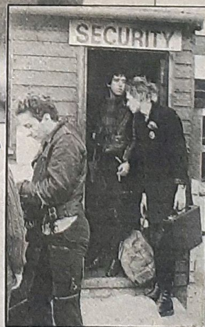
Paul Simonon said: "Punk Rock is the Salvation of Northern Ireland. With the attitudes of parents and the Authorities as they are sectarianism will never end. But kids of both religions come together to hear rock 'n' roll."

*The next evening the Clash played two shows at Trinity College, Dublin. The sets included their new numbers 'Complete Control', 'The Prisoner', 'Clash City Rockers', 'City Of The Dead', 'White Man In Hammersmith Palais' and 'Jail Guitar Doors'. Over a thousand fans packed the place. There was no violence and no damage.