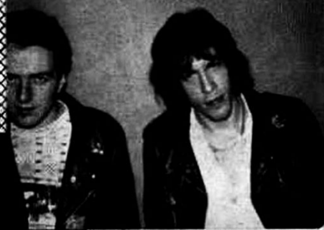
JOE STRUMMER + MIK BELL

In Cambridge Mick Jones called the morons spitting at him "Wankers" which upset them. "We only spit at you cos we like you" Mick replied, "Anyone who spits at me is a fucker" which is a fair statement. The Lu's surprisingly enough, didn't suffer as much spit as Richard Hell. Surprisingly because, a) they are French and b) they are Girls. CBS in Paris have just signed the band up and put them on this tour, to get them a proper taste of the English version. "In France they hate us" but over here they went down just great. The have a very individual guitar sound and the tunes are the type of