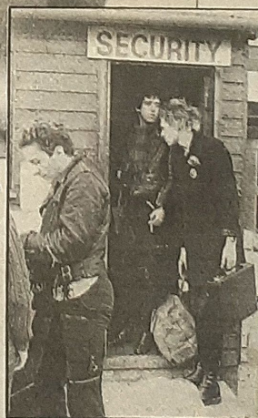
Paul Simonon said: "Punk Rock is the Salvation of Northern Ireland. With the attitudes of parents and the Authorities as they are sectarianism will never end. But kids of both religions come together to hear rock 'n' roll."