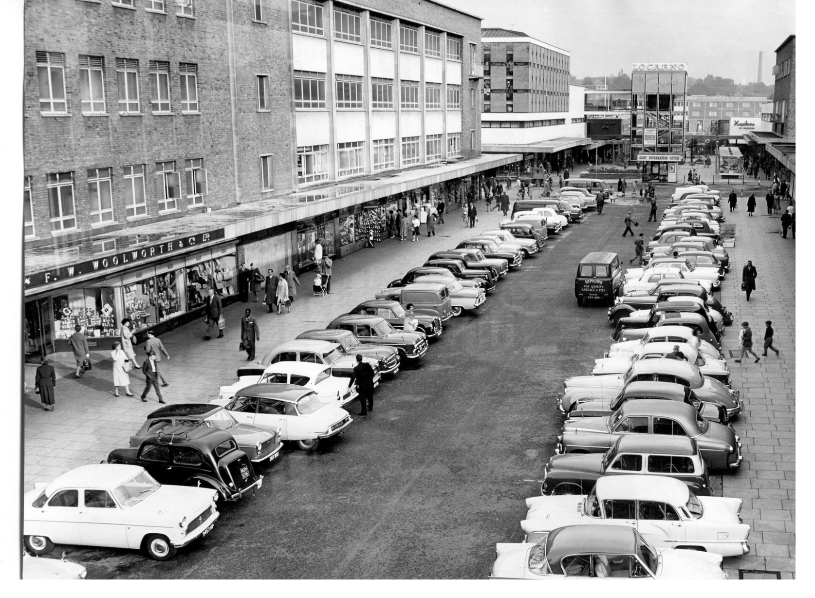
Cars parked in Market Way Precinct, Coventry. Soon there will be a ban on Precinct parking so this sight will disappear. 7th October 19619 of 10