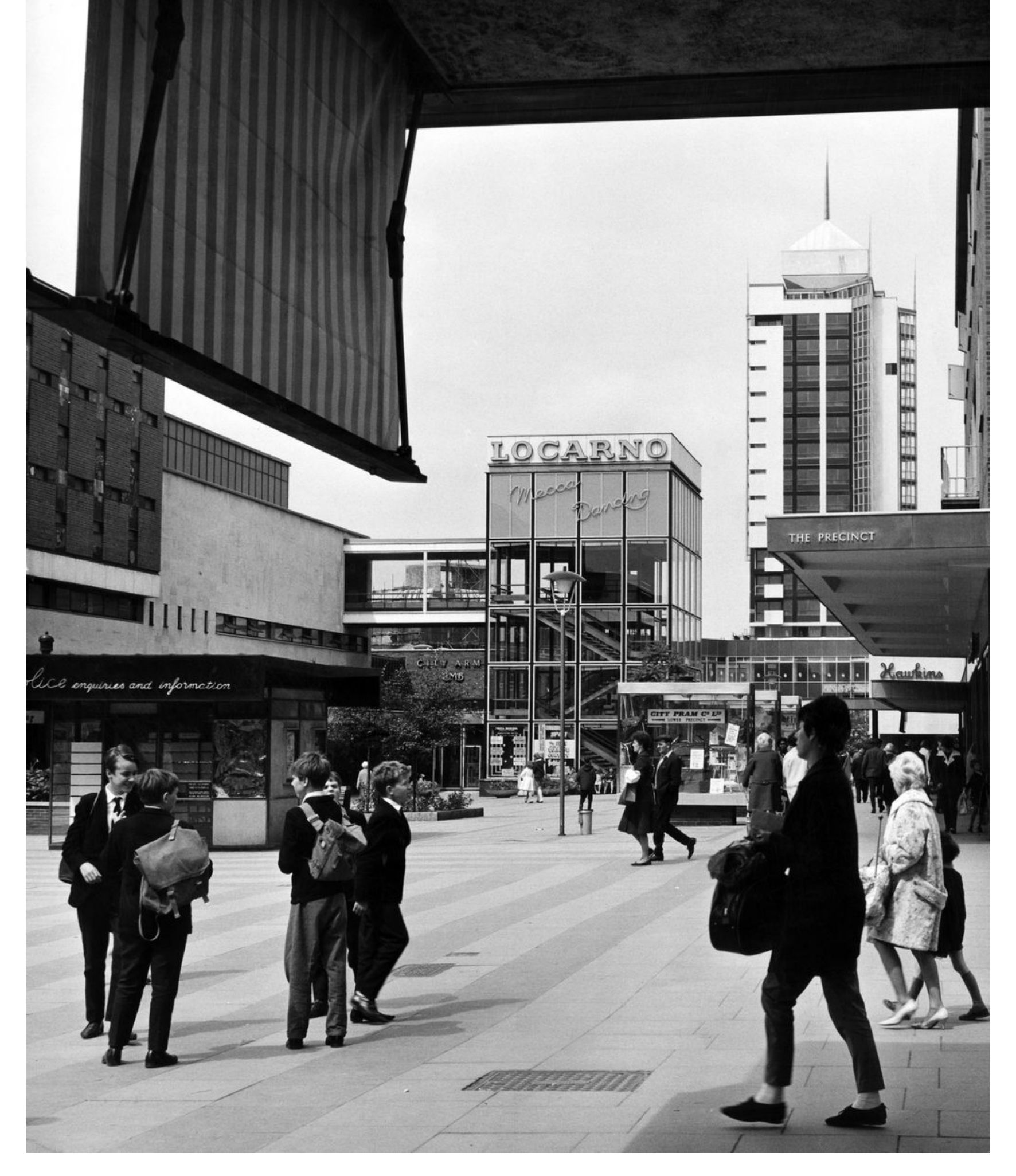
People walking past the shops in Smithford Way, Coventry. 17th July 1965.10 of 10