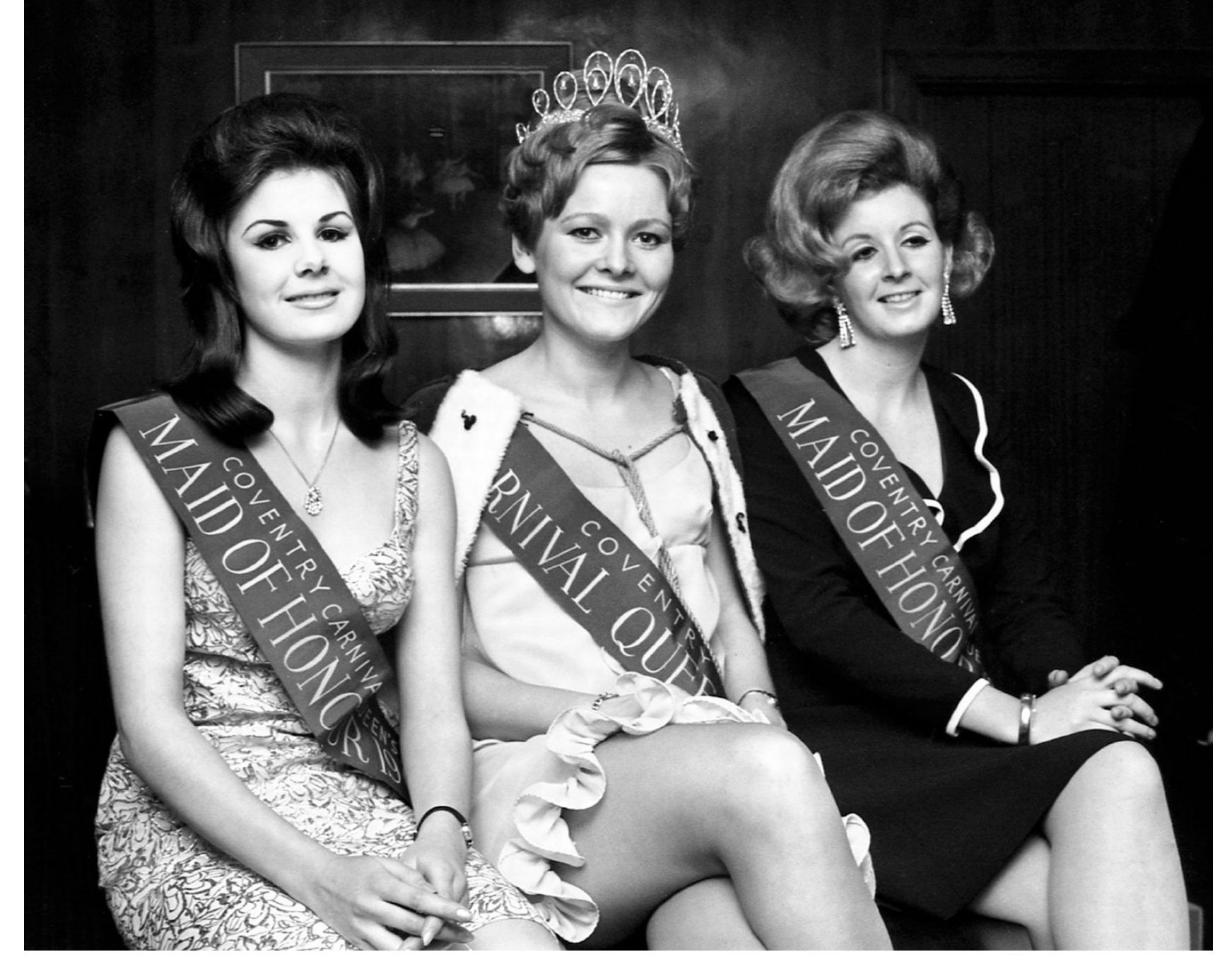
Coventry Carnival Queen and Maid of Honour selection at the Locarno ballroom - 21st March 19682 of 10