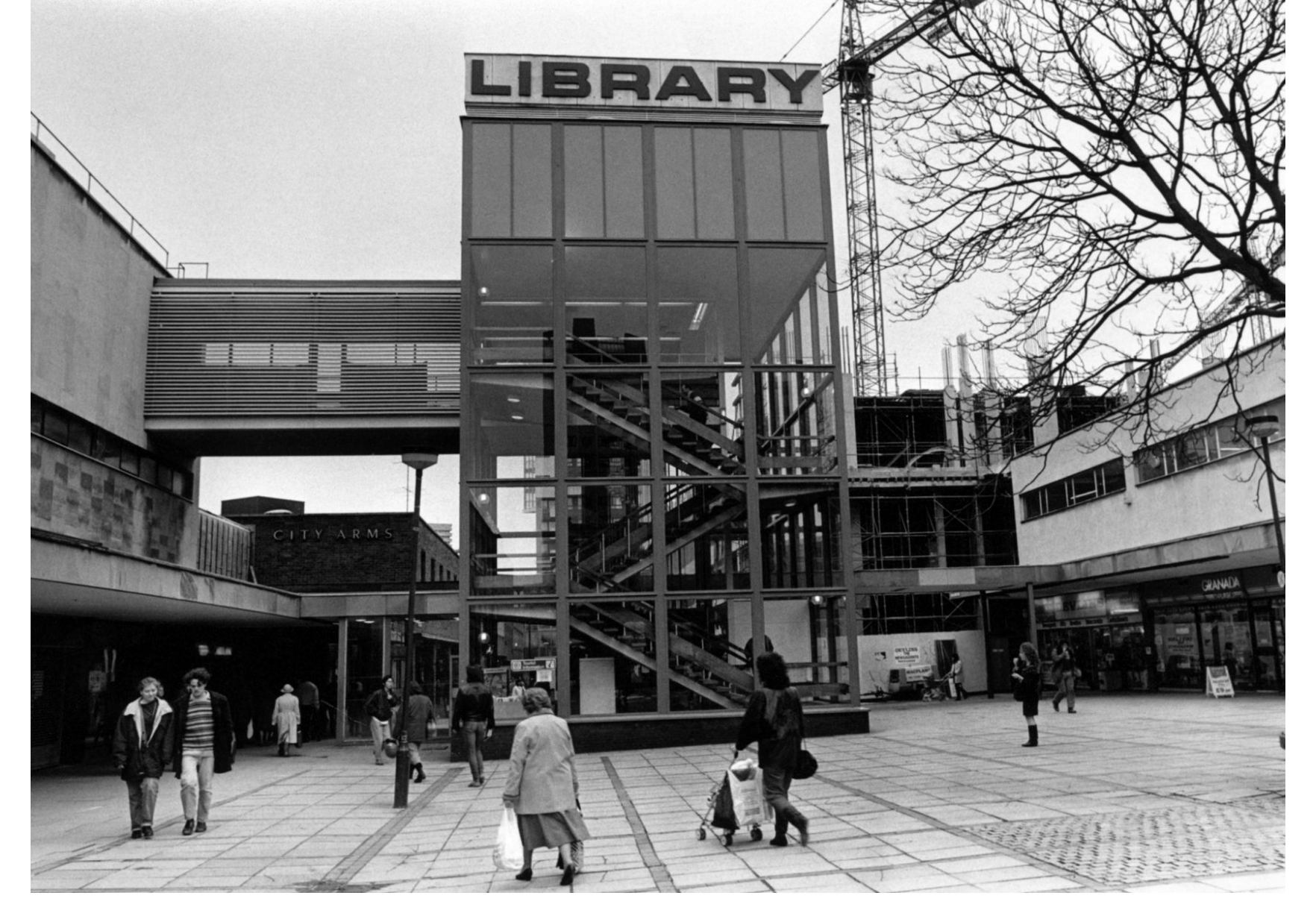
Coventry library, which used to be the old Locarno Ballroom. 1st February 1990.7 of 10