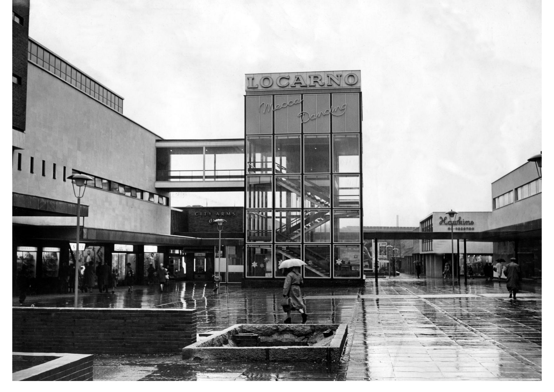
The glass tower entrance to the Locarno club in Smithford Way Precinct, Coventry, in 19603 of 10