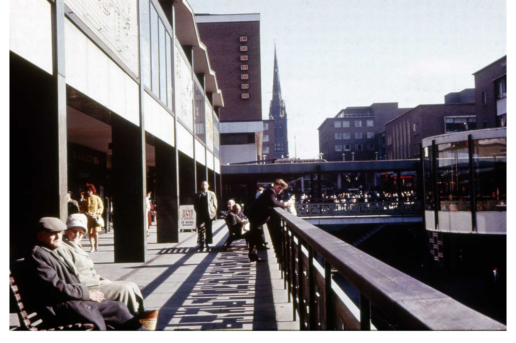
Coventry's Lower Precinct in October 1963 with the Locarno club in the background5 of 10