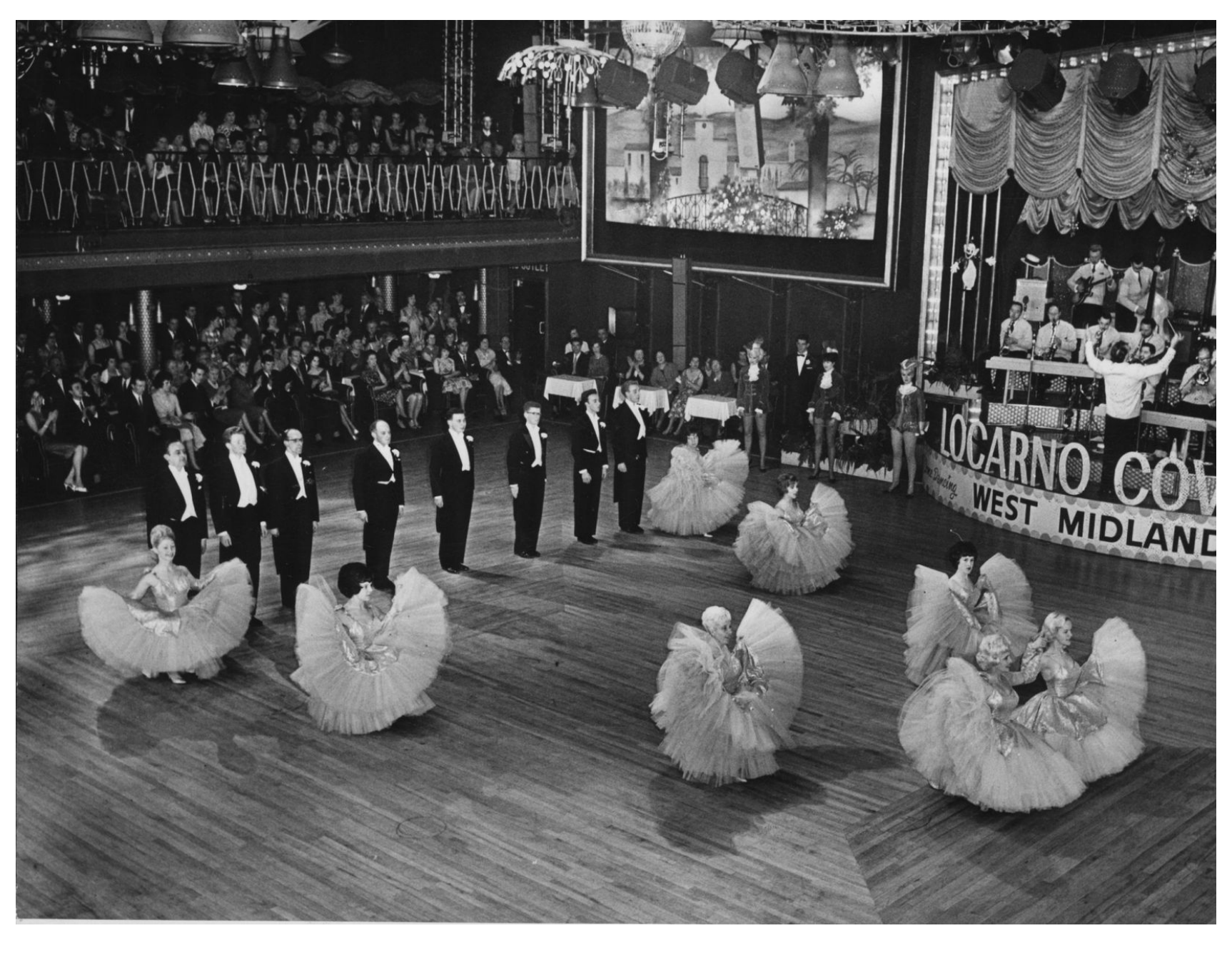
Filming at the Locarno Ballroom showing the West Midlands formation team. December 1962.6 of 10