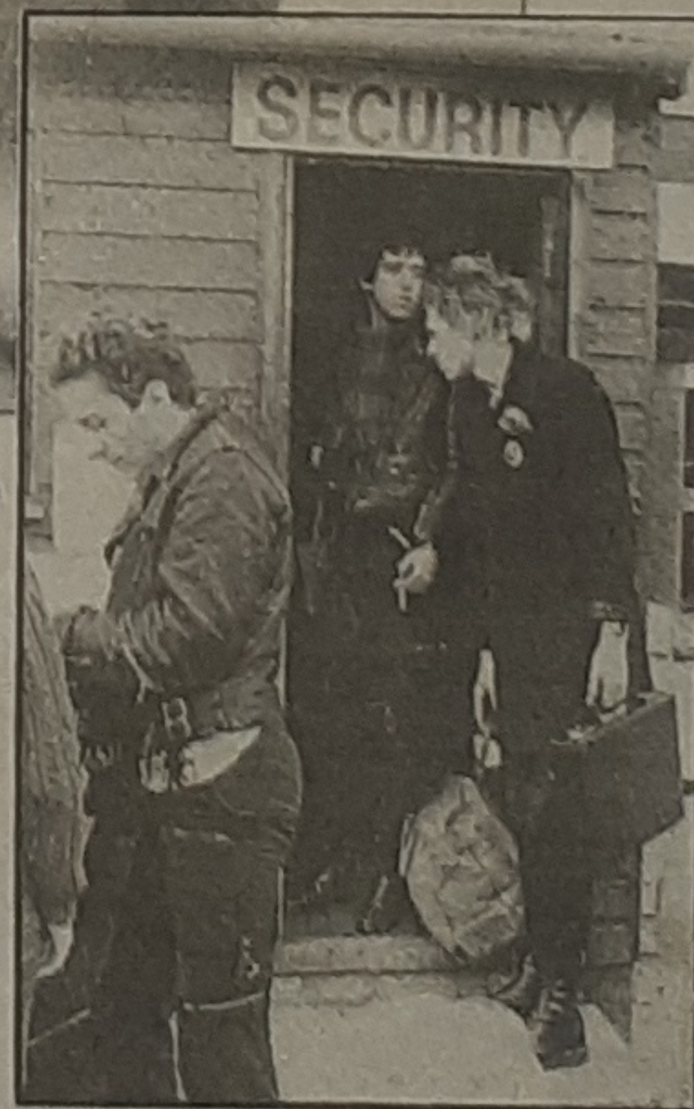
Paul Simonon said: "Punk Rock is the Salvation of Northern Ireland. With the attitudes of parents and the Authorities as they are sectarianism will never end. But kids of both religions come together to hear rock 'n' roll."