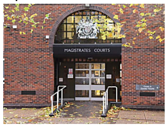
Carer in court charged with ill-treatment of residents