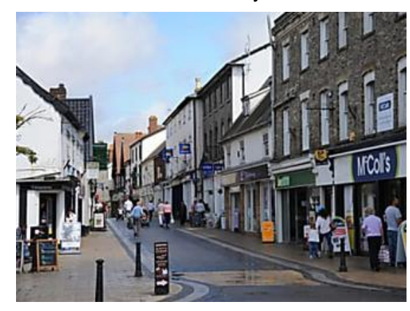
Female shoplifter arrested in connection with £2,000 high street theft