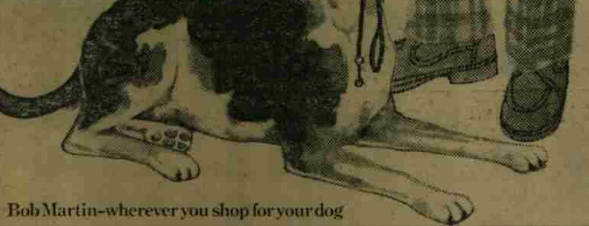
Bob Martin—wherever you shop for your dog

* Also from Bob Martin's PESTROX, a really efficient insecticide, keep Pesty handy. Also, IBS-PROX Worming Treatments for all dogs and puppies.