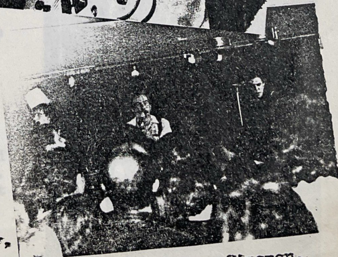
L-R: Jones, Strummer, Simonon. (Roxy, Jan 1st)