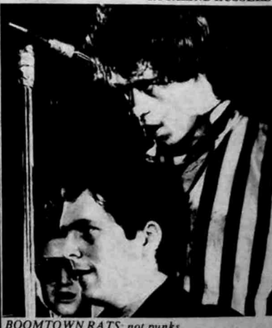
BOOMTOWN RATS: not punks