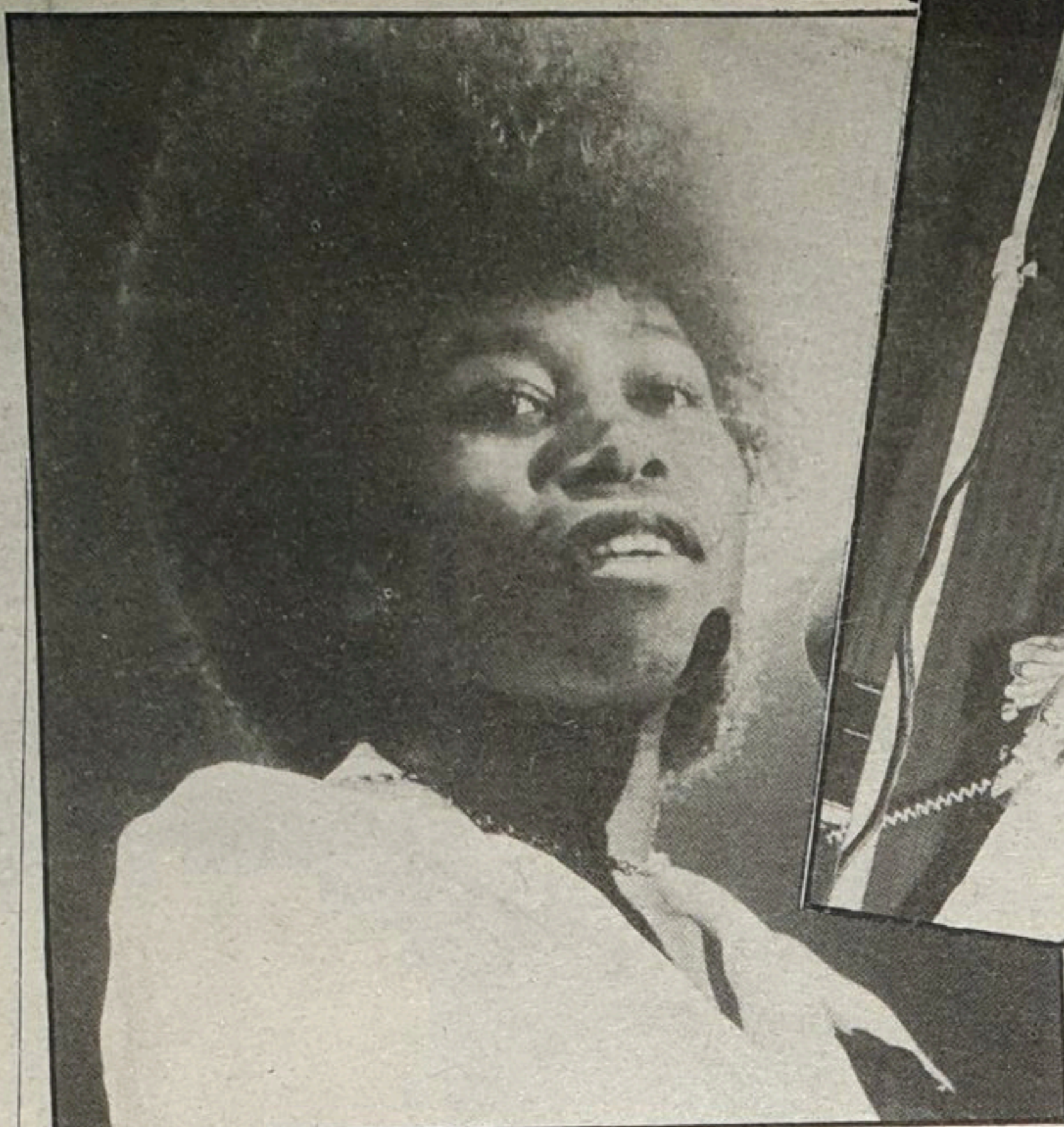
JOAN ARMATRADING: Edinburgh Usher Hall (Monday)