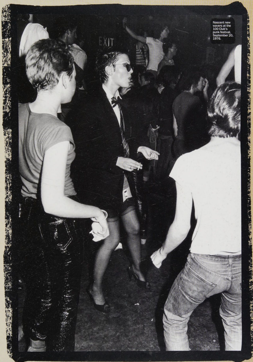
Nascent new wavers at the 100 Club's punk festival, September 20, 1976.

COMPILED BY JOHNNY BLACK.