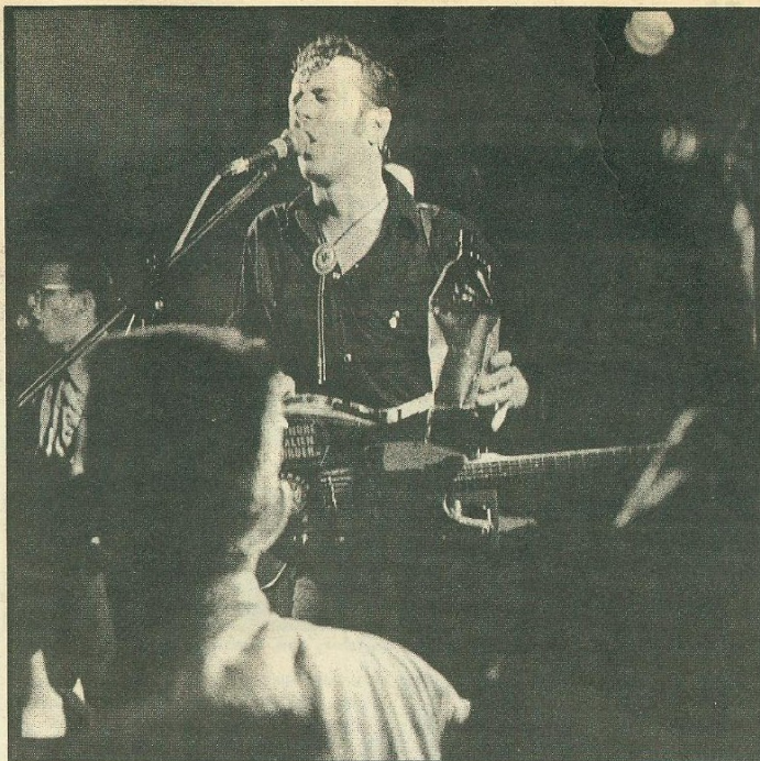
STRUMMER: "MAYBE we shoulda had a revolution along with the French."

After the gig, Strummer is pleased as punch and hauls out the Three Barrels to prove it. Touring, he says, tops it all, as the bus rumbles back to their B&B accommodation.